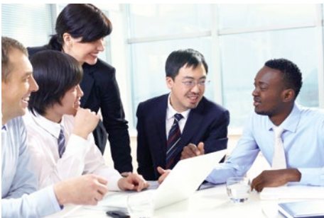
Trainees are taught professional theory at vocational college.