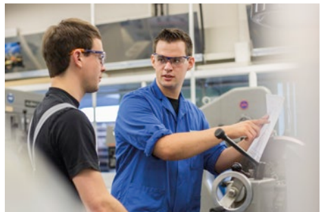
Trainees acquire practical knowledge and skills while working in-house.