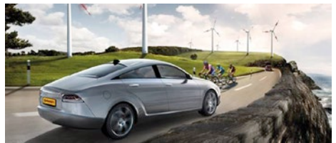
Doing more. For clean power.