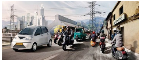
Doing more. For global mobility.