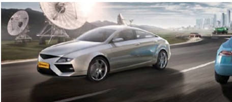
Doing more. For intelligent driving.