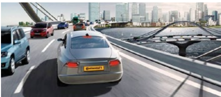
Doing more. For safe mobility.

Continental is one of the largest automotive suppliers in the world. We develop intelligent technologies for transporting people and their goods. Continental currently employs more than 208,000 people in 53 countries and is therefore shaping the future of mobility.